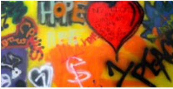
Group panel: All student artists, student mentors and TAC staff, August 2009 Title: 1 Peace Artist Statement: Coming together as one with unique differences, perspectives, cultures, personalities, ethnicities, talents, and style. We all want to say “WE DO” have something positive to give to our community, society, and world!